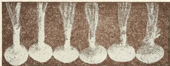
Onion Plants, Ready Now.

Prices on Cabbage plants and Onion plants are the same and I will gladly mix an order shipping part onion plants and part cabbage plants if you desire.